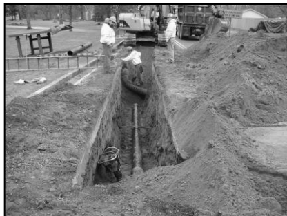
Old Wilson Rd - New Water Main 2011

The Northampton DPW Water Division's Mission is to provide sufficient amounts of safe, clean, and potable water for drinking and fire protection, while complying with all statutory regulations set by the Environmental Protection Agency and the Massachusetts Department of Environmental Protection.