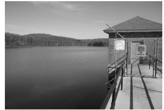
Mountain St Reservoir Gate House