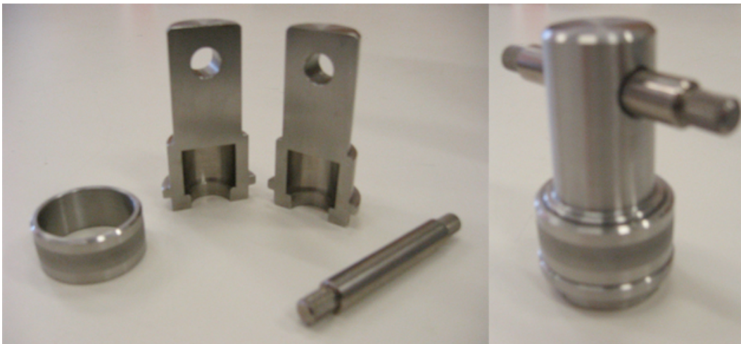
Figure 2. Custom made shoulder grips used to hold the tension coupons during testing.