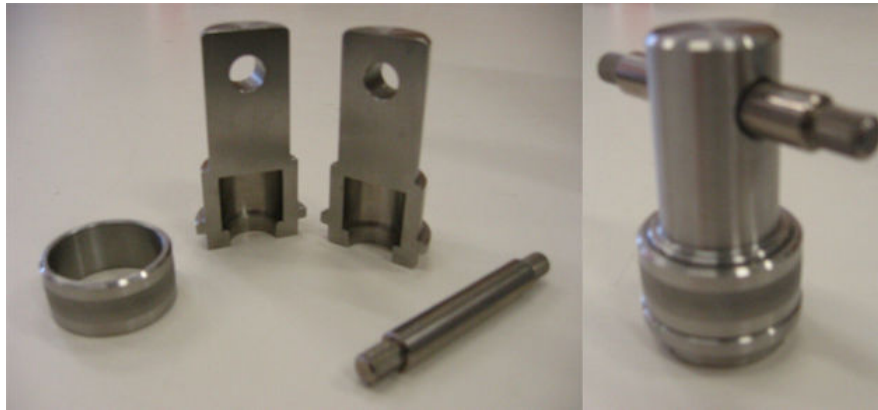
Figure 3. Custom made shoulder grips used to hold the tension coupons during testing.

While testing the specimens were subject to 0.005 inches of strain per minute until 15 ksi of stress is reached. During this time, an extensometer was used to accurately measure strain. After 15 ksi of stress is reached, the extensometer was removed and the strain rate was increased to 0.05 inches per minute. The testing machine's cross head displacements were used to record strain measurements after the extensometer was removed. Testing continued until the specimen failed.