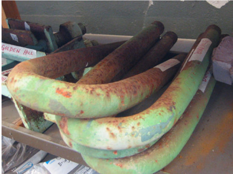
Figure 1. Bondsville beam hangers before being cut into tension coupons.

The tension coupons used in testing were cut from pieces of wrought iron bridge members. Two curved beam hangers from the Lower Bridge in Bondsville were used to create 8 tension coupons. Figure 1 features a photograph of these beam hangers before being cut into tension coupons.